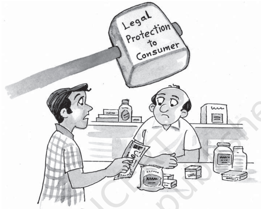
Protection against malpractices and exploitation

remedies available to parties in case of breach of contract.