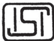
Mark of Bureau of Indian Standards