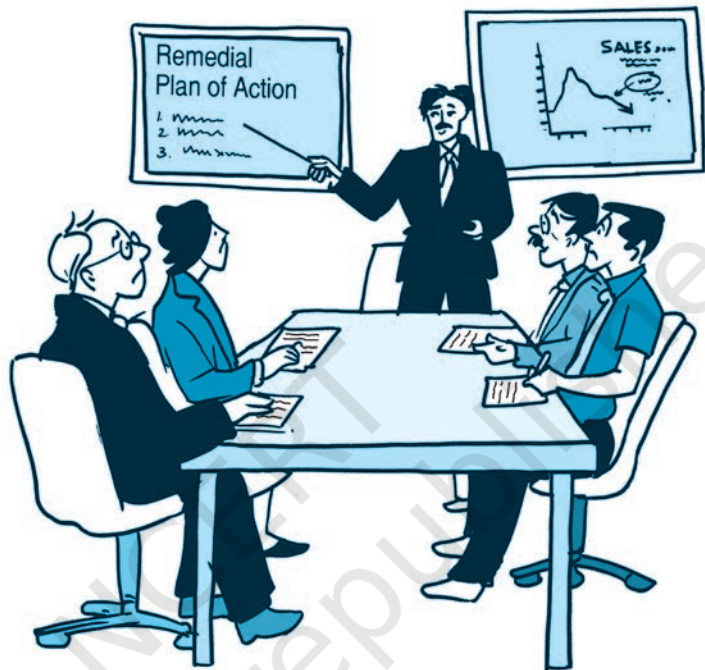
Some examples of Corrective Action